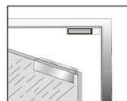
U Bracket Installation