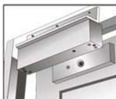
LS Bracket Installation